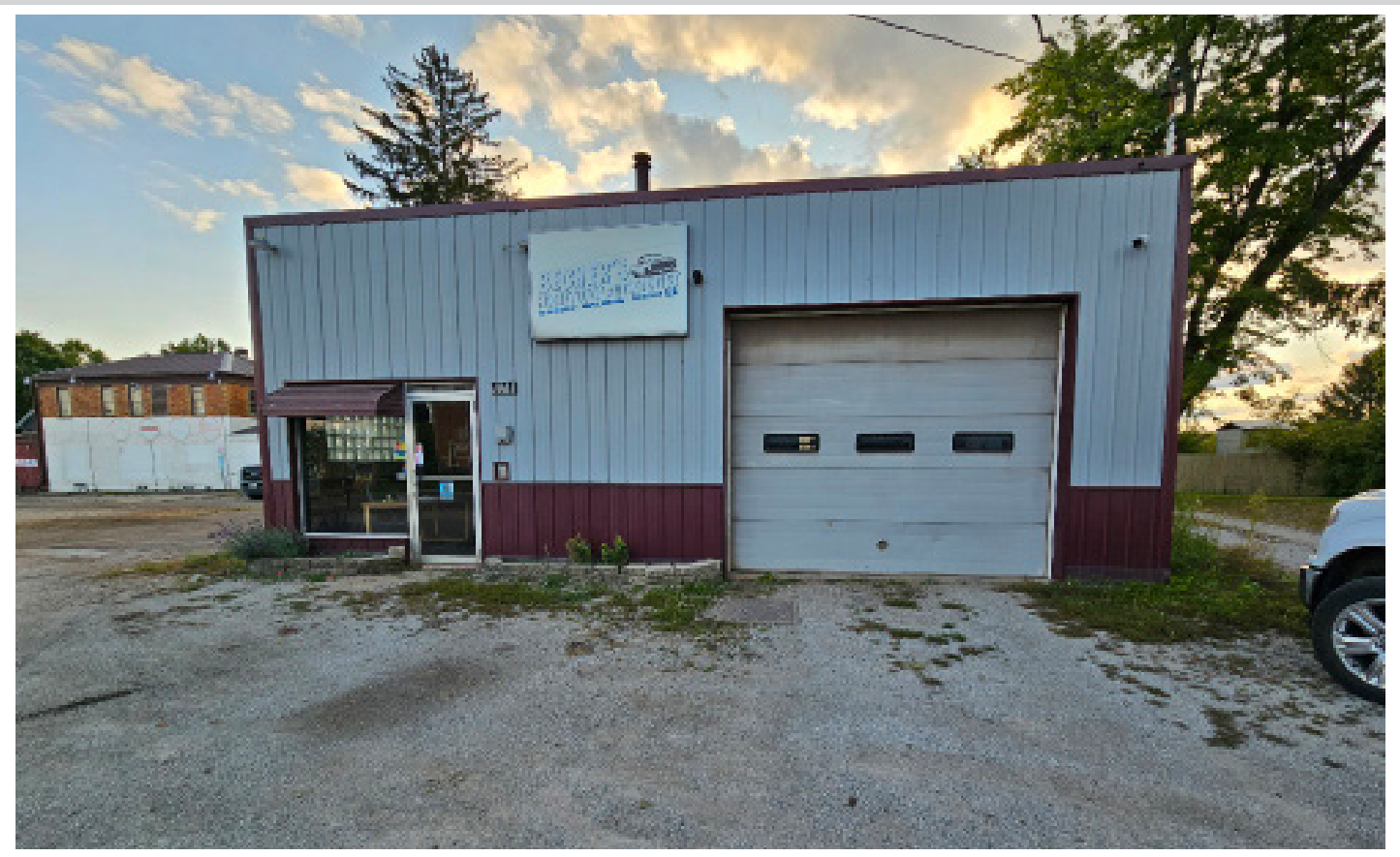
Information is believed to be accurate but not guaranteed. KIKO Auctioneers

Directions: Take SR 183 north of Minerva or south of Alliance to auction. Watch for KIKO signs.